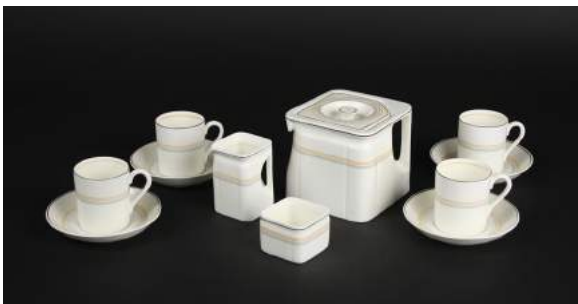
RMS Queen Mary Cunard Steamship Co. Tea Set, Foley China, England, bone china, glazed and decorated, tea pot H: 3.875" & 4" square, creamer H: 2.875" & 1.875" square, sugar H: 1.5" & 2" square, 4 teacups H: 2.375" & Diam: 2.375", 4 saucers. Museum Purchase 2014.159.

There are so many ways to enjoy tea. A visit to the special exhibition, Tea , an exhibition made possible as the result of a partnership between the Dinnerware Museum, Zingerman's Coffee Company, and ZingTrain, reveals more than a dozen ways. The Dinnerware Museum woefully lacks its own permanent exhibition space at this time, has stellar tea objects, and Zingerman's Community of Businesses both have the attention of foodies and are businesses with a divine sense of good taste. Voilà, a special exhibit for everyone who likes to eat and drink anything.