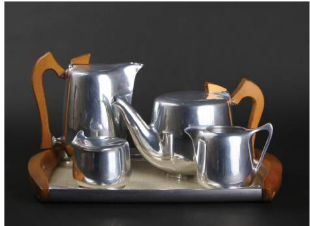
Picquot Ware Tea Service with Tray, England, ca. 1950s-1960s, tea pot H: 6", hot water jug H: 7.5", milk jug H: 4", covered sugar bowl H: 3.5", tray L: 15.5", magnalium with sycamore handles and tray with heat resistant wareite centre, Museum Purchase 2014.172.

from each other at Zingerman's Southside location in Ann Arbor. Zingerman's Coffee Company is open M-F 7am-6pm and Saturdays and Sundays 8am-5pm. Phone 734-929-6060 for more information. ZingTrain is open M-F 9am-5pm. Phone 734-930-1919 for more information. Viewing will end April 10 th .