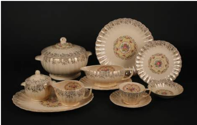
Sebring Pottery, Sebring, Ohio, Trojan shape, Toledo Delight pattern, ca. 1940, semi-vitreous china with gold trim, dinner plate, bread and butter, gravy boat with underplate, berry bowl, lidded casserole, cup & saucer, platter with cream and sugar, 2014.183 Museum Purchase.