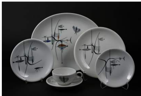
Shenango China, 1950s-60s, restaurant china, glazed, decals