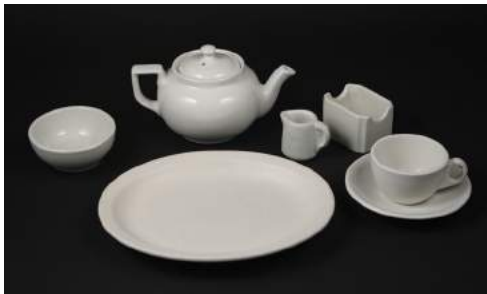
Diner china from various American manufacturers. Museum Purchases.