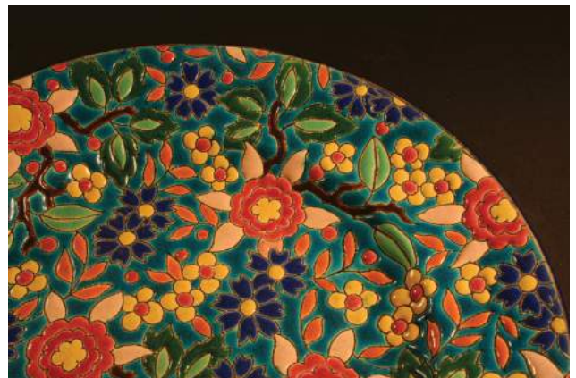
French Longwy Ware

Riverside Art Center, Ypsilanti, Michigan August 6-29, 2015