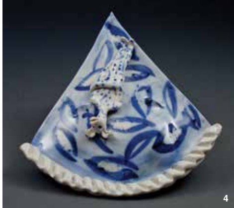
1, 2 Toni Ross' April 13, installation view and detail, 23 ft. 6 in. (7.2 m) in length, stoneware, slip, gold leaf, 2016. "Artists Choose Artists," at Parrish Art Museum (parrishart.org) in Water Mill, New York, through January 16. 3 Coille Hooven's Hookah Animals, porcelain. 4 Coille Hooven's Puppy Pie, porcelain. 3, 4 5 Coille Hooven's Swan Song, porcelain, 1979. "Coille Hooven: Tell It By Heart," at Museum of Arts and Design (madmuseum.org) in New York, New York, through February 5. 6 Keith Rice-Jones' Reflection, 6 ft. 3 in. (2 m) in height, stoneware, glaze, 2015. "Monumental Sculptures and Convention," at Surrey Art Gallery (surrey.ca/artgallery) in Surrey, British Columbia, Canada, through April.