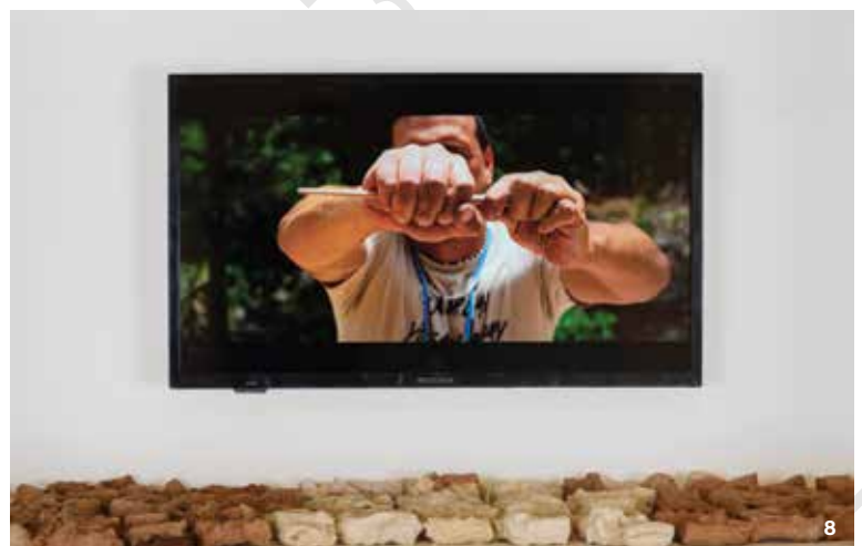
1 Gregory Tegarden's Jar #36 , 23 in. (58 cm) in height, soda-fired stoneware, porcelain attachments, locally found clay slips, 2017. Collection of the San Angelo Museum of Fine Arts. 2 Ariel Bowman's Darwin , 24 in. (61 cm) in height, ceramic, mixed media, 2021. 3 Brooks Oliver's Legs4days , 9 in. (23 cm) in height, porcelain, 2021. "2021 San Angelo Ceramic Invitational Exhibition," at the San Angelo Museum of Fine Arts ( www.samfa.org ) in San Angelo, Texas, through June 27. 4 Austin Coudriet's Object Arrangement No. 1-16 , earthenware, paint, wax, 2021. 5 Maria Spiess' Ripple Effect , 9½ in. (24 cm) in height, porcelain, black ceramic, 2020. 6 James Lee Webb's Blue Corduroy Teapot , 10¼ in. (26 cm) in height, white stoneware, fired to cone 6, 2020. "Exhibition of New Works by our Resident Artists," at the Clay Art Center ( www.clayartcenter.org ) in Port Chester, New York, June 28–August 6. 7 Fujino Sachiko's Form 19-4 , 25¼ in. (65 cm) in diameter, stoneware, matte glaze, 2019. "Forming A Voice: New Sculptures by Fujino Sachiko," at Joan B Mirviss LTD ( www.mirviss.com ) in New York, New York, ongoing. 8 Cannupa Hanska Luger's Something to Hold Onto , video still 3. "Passage | Cannupa Hanska Luger," at Mesa Contemporary Arts Museum ( https://mesaartscenter.com ) in Mesa, Arizona, through August 8.